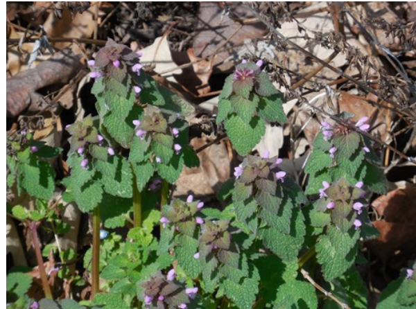
Winter annual weeds like this purple deadnettle were flowering in late March and early April this year.

Follow me on Twitter @purduehortindy (or view at: http://twitter.com/purduehortindy ) for more tips. You don't have to be on Twitter to simply view my comments.